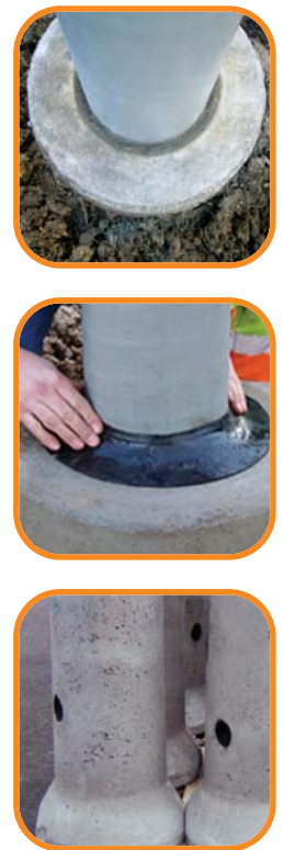
WITHOUT CABLE DUCT FOR NON-ILLUMINATED SIGNS